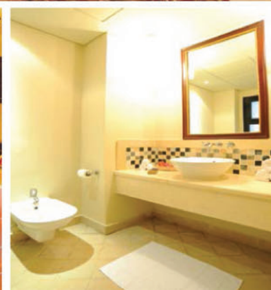
Provide rustic comfort, and charm